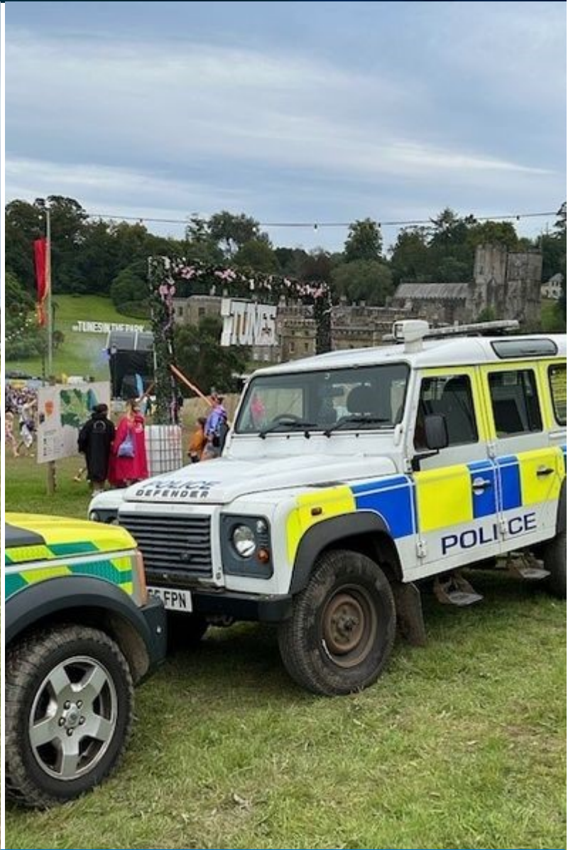
Liskeard Police showed a presence at Tunes in the Park at the Port Eliot . Some good engagement with staff and attendees. Top tunes as well.